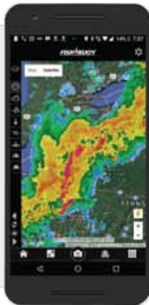
! Predict how precipitation changes water levels