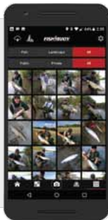
! Manage all your fishing photos/logs in one place