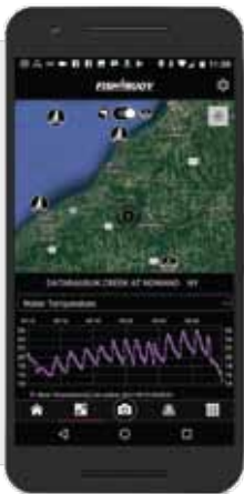
! Learn how water levels, flows, and temperatures affect fishing