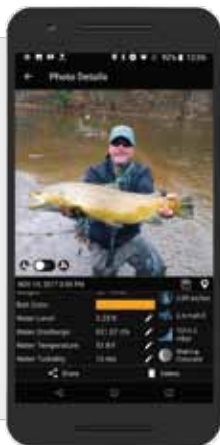
! Recall past fish catches, identify trends, and plan trips right