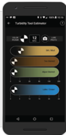
! Plan the best bait colors based on water clarity