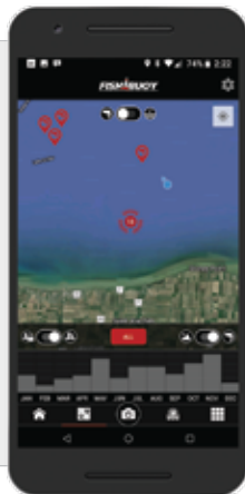
! Your spots are marked with each photo, now go back!