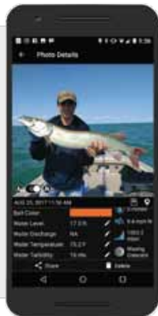
! Recall past fish catches, identify trends, and plan trips right