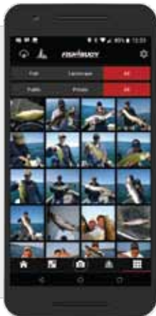
! Create a comprehensive digital diary full of data

Download FISHBUOY Pro today and turn your mobile camera into a powerful fishing tool.