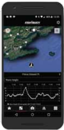
! Plan trips according to wave heights, winds and pressure