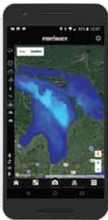
! Find fish by following shifting surface water temperatures